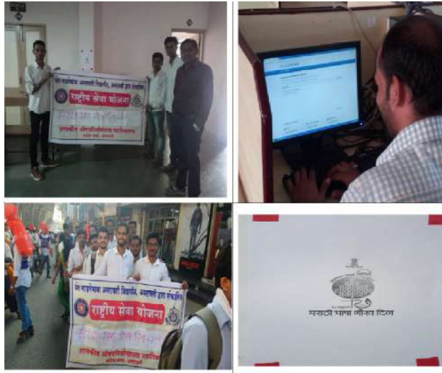
Marathi Bhocha Consox (27.12.2018)