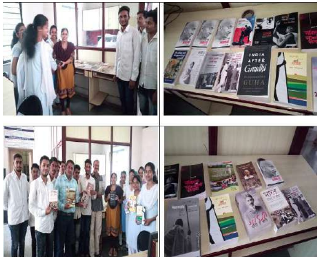
Granthotsav 2018 (Book fair in GCOPA)