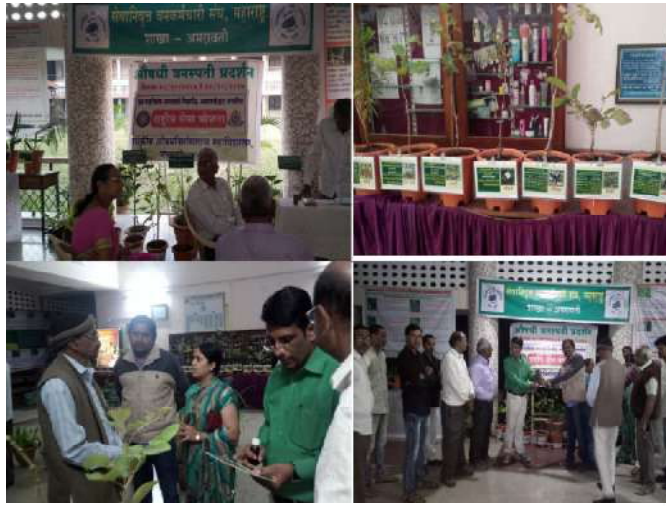
Medicinal Plant Exhibition 28.12.18-30.12.18